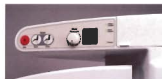
Convenient activation panel