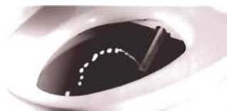
Gentle warm water cleansing