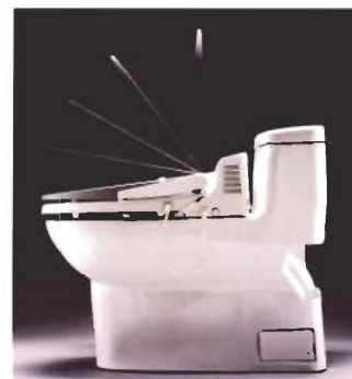
Engineered with TOTO's SoftClose Seat to eliminate annoying "toilet seat slam"

As expected from the leader in technology and innovation, Chloe has been designed for easy installation and cleaning. It fits many one and two-piece toilets and comes with easy to follow directions.